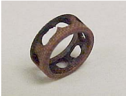
Ball Pocket Wear