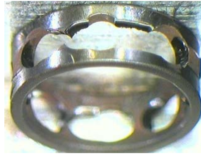
Ball Pocket Wear