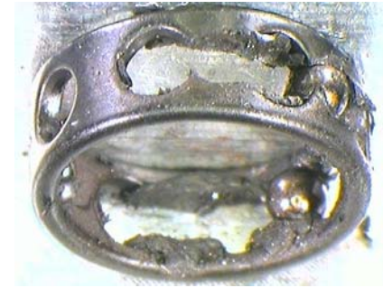
Ball Pocket Wear