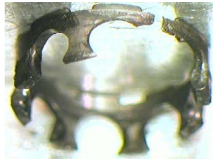
Ball Pocket / OD Wear