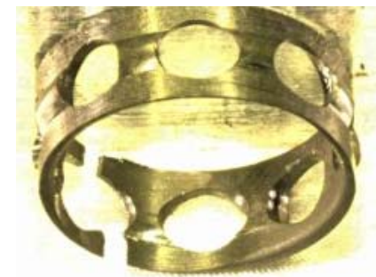
Ball pocket/OD/ID Wear