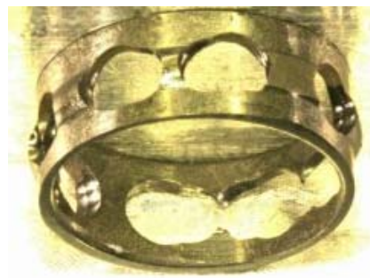
Ball pocket/OD/ID Wear