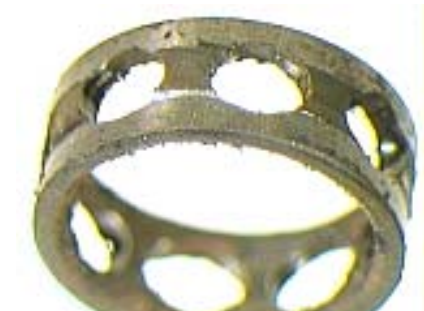
Ball Pocket / OD Wear